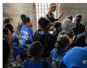
4th Grade visit St. Augustine