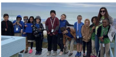
2nd grade Barrier Island Trip