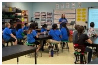
4th and 5th grade Math Bowl with OCS lower campus