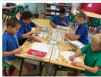
2nd Grade Learning about money!